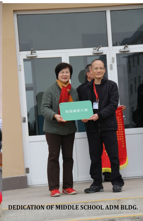
DEDICATION OF MIDDLE SCHOOL ADM BLDG.